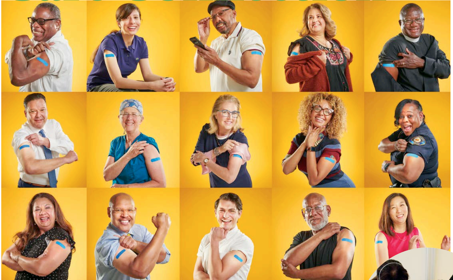
Pasadena community leaders earned their bandages of honor by receiving the COVID-19 vaccine.